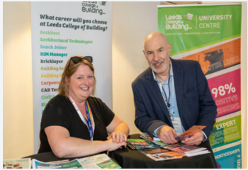
Example of a 'Street Stand' exhibition space

All members are welcome to use the stand as a meet up point throughout the event and are invited to Drinks with Interact at the stand at 4.00 pm on Tuesday 21st May.